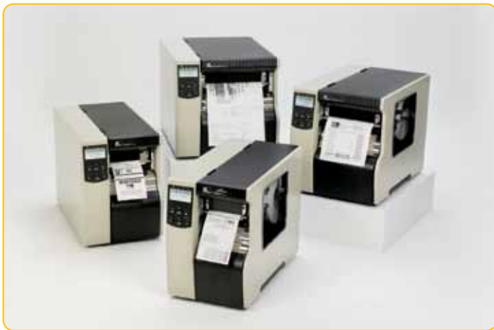
Mission-critical printers – Xi series