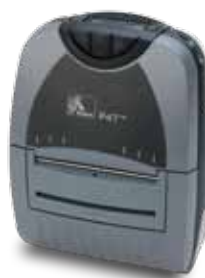
P4T™ mobile printer

The wireless capability in Zebra printers means you no longer have to locate your printers beside a network point, enabling greater flexibility for your printing needs. Zebra printers support 802.11b/g wireless networks and a wide range of security standards and protocols. ZebraNet™ Bridge Enterprise allows remote management and monitoring of wireless printers.