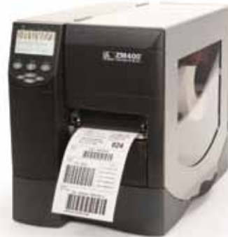
Industrial printers – ZM400/ZM600

These include the all-metal 105SL™, and the rugged ZM400™ and ZM600™ printers. For lower-volume applications, the S4M™ printer offers outstanding value.