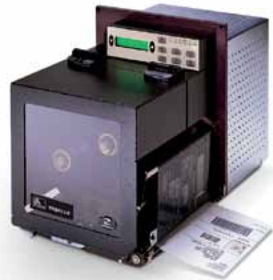
Unattended printing – 170PAX4™/110PAX4™ printers